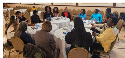
Focus Group Discussion at the VEC

Victoria, B.C., Canada. March 4, 2024: The African Arts and Culture Community Contributor Society (AACCCS)-ISSAMBA Centre honored Black History Month 2024 with a diverse range of engaging events, showcasing the rich heritage and invaluable contributions of Black individuals in Canada. Under the theme "Black Excellence: A Heritage to Celebrate; a Future to Build", last year's commemoration promised a deeply enriching experience for all participants.