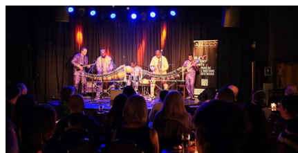
Issamba Showcase at the Victoria Event Centre

In addition to these highlights, AACCCS-ISSAMBA Centre hosted an online Forum on Community Immunity Awareness on February 10, focusing on the importance of flu vaccination and its implications for public health.