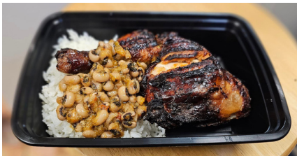
Food take-out during the Mama Put

On February 24, AACCCS-ISSAMBA Centre also held Mama Put, an adaptation of African street food vending, at the Philippine Bayanihan Community Centre. This event showcased a variety of African cuisines for the public to enjoy, such as Puff-puff, Piri-piri Chicken, Cameroonian-style Bean Stew, Ginger Juice, and more.