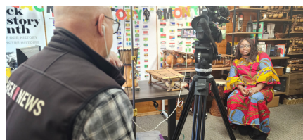
Interview by CHEK News at the office

Victoria, B.C., Canada. March 4, 2024: The African Arts and Culture Community Contributor Society (AACCCS)-ISSAMBA Centre honored Black History Month 2024 with a diverse range of engaging events, showcasing the rich heritage and invaluable contributions of Black individuals in Canada. Under the theme "Black Excellence: A Heritage to Celebrate; a Future to Build", last year's commemoration promised a deeply enriching experience for all participants.