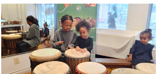
Sankofa Moments for the Kids and the Youth