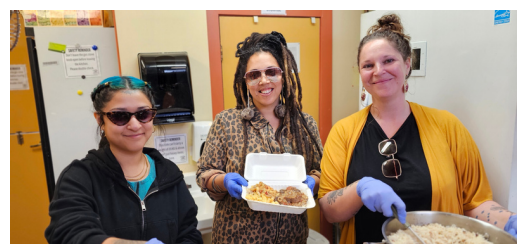
Mama Put features the Taste of the Caribbean dish

The event not only celebrated diversity but also served as a reminder of the ongoing fight against racial discrimination. By coming together to share food, knowledge, and culture, the AACCCS-Issamba Centre reaffirmed its commitment to creating a more inclusive and equitable society.