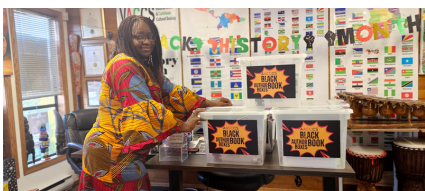
Black Author Book Boxes for dispatch