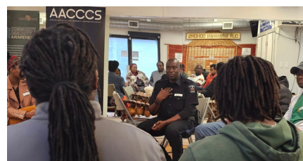
BHM Launch Reception Pre-show

Continuing the momentum, the centre facilitated discussions on the milestones and progress of the International Decade for People of African Descent (IDPAD), offering insights into ongoing efforts to promote and safeguard the rights of individuals of African descent. These discussions sought to raise awareness and advocate for substantive changes in policies and practices impacting the Black community.