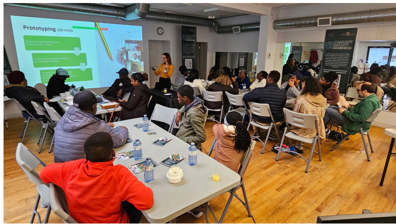
Respiratory Illnesses and Flu-shot Management Design Thinking Workshop

Victoria, March 23, 2024: The AACCCS-Issamba Centre proudly commemorated the International Day for the Elimination of Racial Discrimination with a diverse and engaging event held at the Philippine Bayanihan Community Center. Taking place on Saturday, March 23rd, from 11 am to 8 pm, the celebration brought together members of the community in a powerful display of unity and solidarity.